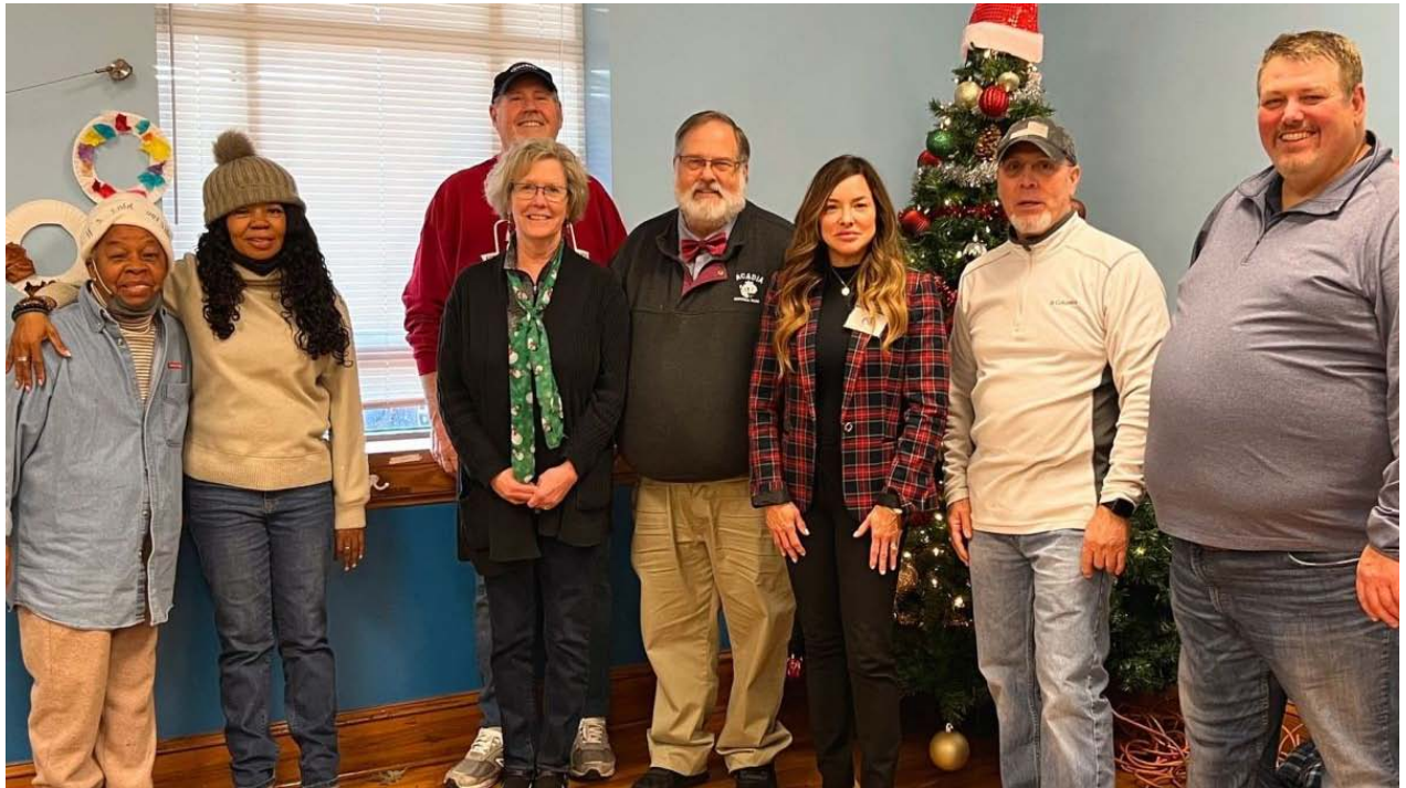
Serving Dinner at the Boys and Girls Club

Meeting Link: https://us02web.zoom.us/j/83451707408?pwd=UG55djNIRGRBdGlmZFRSG80MXY3UT09